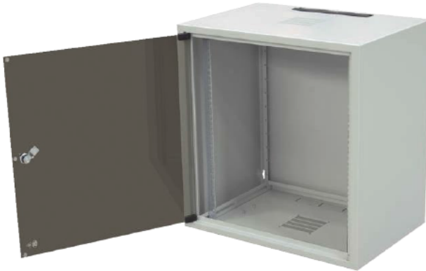
SJ cabinet 12 U with safety glass door