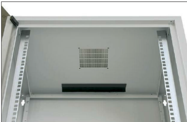
Top plate of SJ cabinet

Single-section body, door, rear panel, earthing cable for rear panel, door earthing cable (only for steel door), 2 mounting angles, brush, template for drilling holes in the wall.