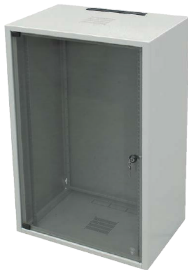
SJ cabinet 18 U with safety glass door