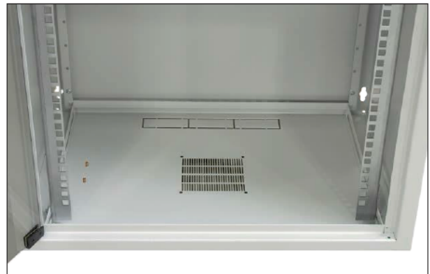
Bottom plate of SJ cabinet