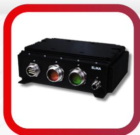
Atom-based Rugged Mission Computer System, ComSys-5361