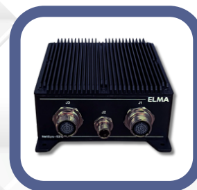
NetSys-5310 Rugged Cisco ESR-6300 Router