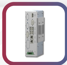
ProSys-5101, Industrial Embedded Computing Platform