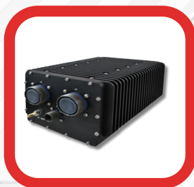
Mini ATR – 3U, VPX, Rugged, Small Form Factor 3-Slot